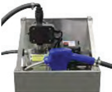
DEFTBCSS10 10' dispense hose DEFTBCSS20 20' dispense hose