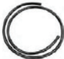
DEF510COM-HOSE1 10' x 3/4"