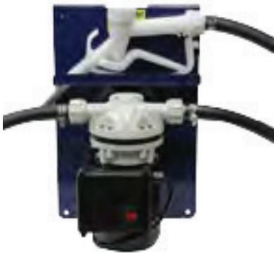
DEFTB10MN 10' dispense hose DEFTB20MN 20' dispense hose