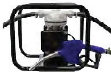
DEF12V10SN 10' dispense hose DEF12V20SN 20' dispense hose DEF12V30SN 30' dispense hose