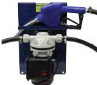
DEFTB10SN 10' dispense hose DEFTB20SN 20' dispense hose