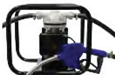
DEF12V10SN 10' dispense hose DEF12V20SN 20' dispense hose DEF12V30SN 30' dispense hose