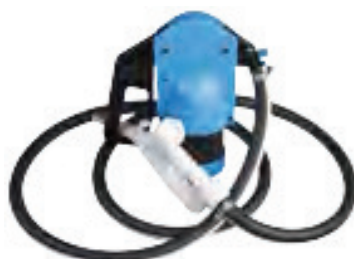
DEFR12068010 10' dispense hose

Note: This pump does not utilize the Micromatic adapter or fitting.