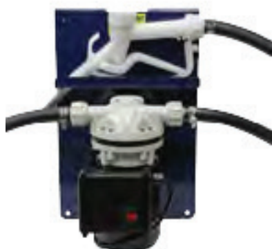
DEFTB10MN 10' dispense hose DEFTB20MN 20' dispense hose