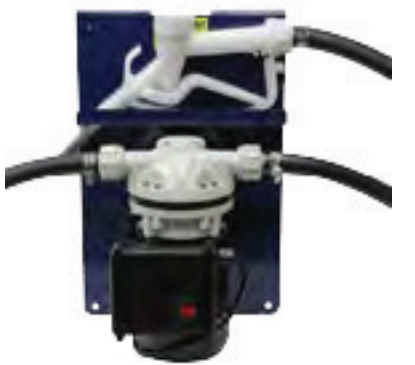
DEFTB10MN 10' dispense hose