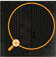
Optional Dot Anti-Spray